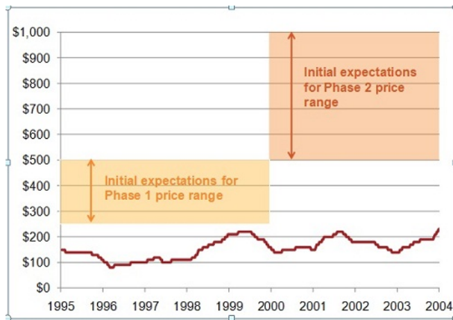
Figure 1 – SO 2 allowance price (tonne SO 2 )