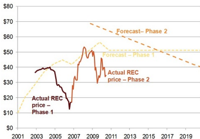
Figure 4 – Actual REC prices versus forecasts ($/REC)